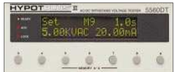
High resolution LCD clearly indicates setup parameters and test results. Single function dedicated keys speed setup without scrolling through the menu.