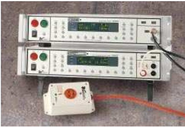
HypotPLUS® II shown with HYAMP® II and interconnecting receptacle box for testing products terminated in a line cord. Also shown are the standard rack mount handles.