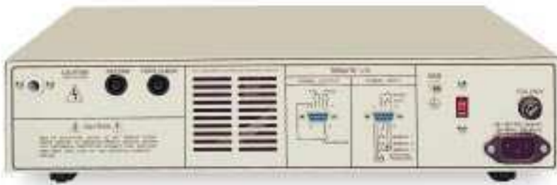
HypotPLUS® II includes rear panel high voltage and return connections and remote control connections to make it easier to build into a rack mount system.